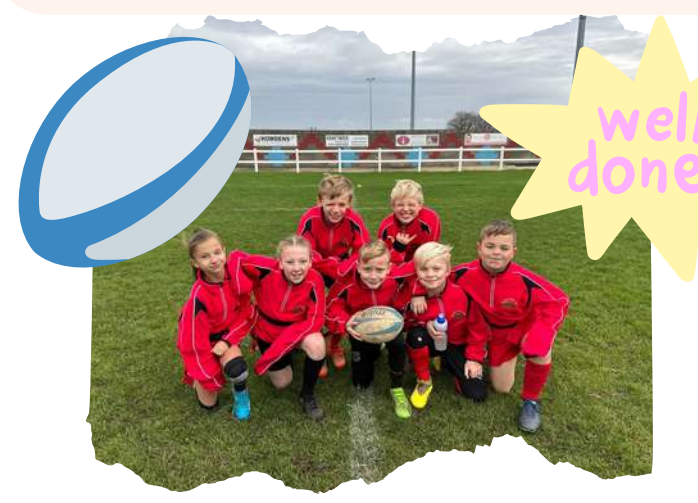
Well done to all who participated in the rugby competition. We are proud of your efforts.